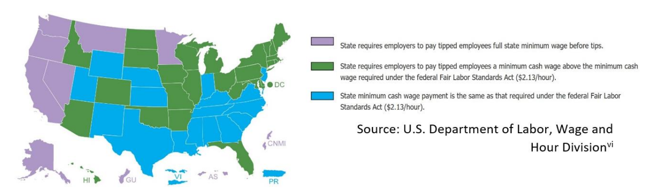
FIGURE 1. Minimum Wages for Tipped Employees

The federal minimum wage for tipped workers has not changed in almost 30 years, with the last increase in 1991 when it was set to $2.13/hour. While the most recent economic recovery has reached those at the top of the income ladder, it has left too many behind. According to the Bureau of Labor Statistics (BLS), occupations that rely on tipped work, like wait staff, are among the fastest growing occupations. Today, almost 70% of tipped workers in the US are women and the poverty rate for tipped worker is twice that of the rest of the US workforce.